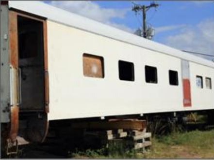
Sample Metal Restoration